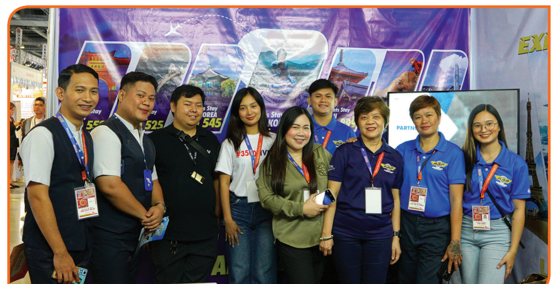
AAP Travel employees and SM Mall of Asia staff get together for a photo op during the 2024 Travel Madness Expo (TME).