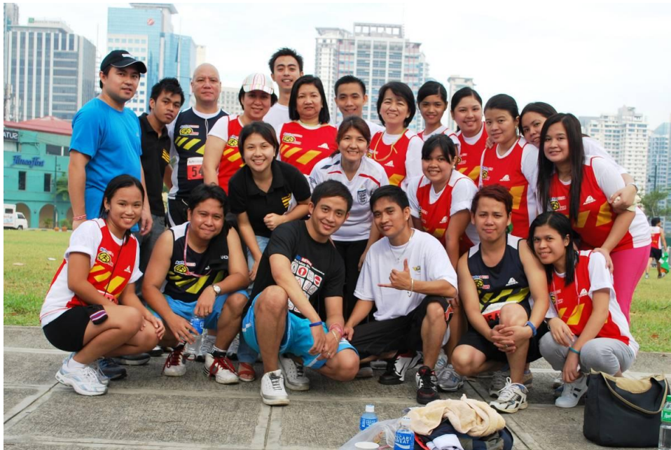
Twenty AAP employees joined the 4 th Auto Review’ Run for Road Safety and Courtesy.

The event concluded with the awarding of this year’s Auto Review winners. By supporting events like the Auto Review Run for Road Safety and Courtesy and continuously developing other projects that increase public awareness of road safety and courtesy, AAP aims to make roads safer for all road users.